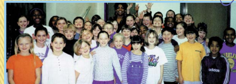
"At the heart of it is the fact that if those little hands were holding paintbrushes, drumsticks or a saxophone, they wouldn't have time to hold a gun." — Nnenna Freelon