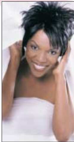
In association with William Morris Agency

When she brought the house down with a standing ovation at the 43rd Annual Grammy® Awards telecast, the five-time Grammy Award nominated singer-songwriter-arranger had host John Stewart and music's and film's brightest stars championing Nnenna as the "new international voice of jazz". Her new recording "TALES OF WONDER: Celebrating Stevie Wonder" promptly jumped to the Top Ten on Billboard and earned her phenomenal praise from Wonder himself.